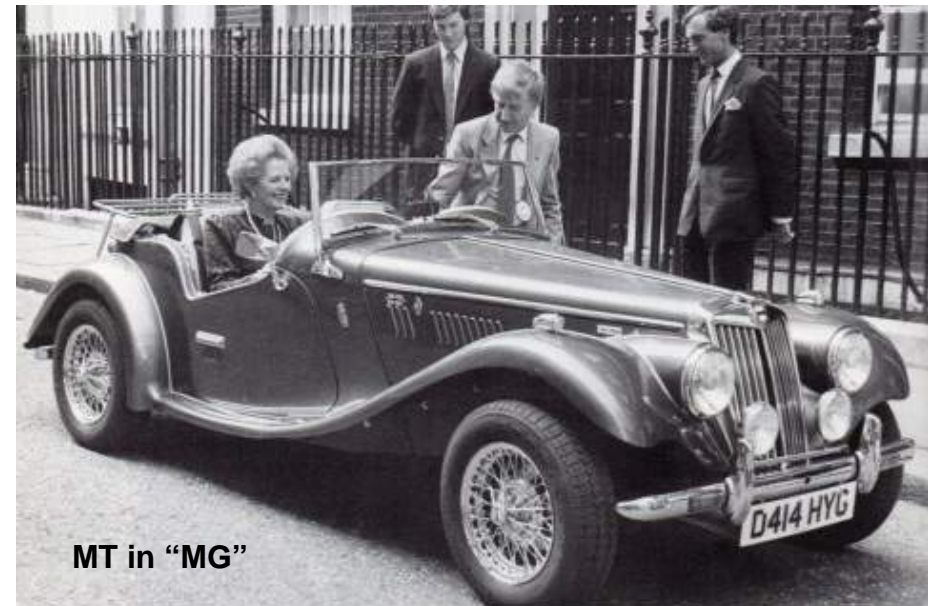
MT in "MG"