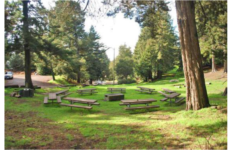
Craib Meadow Picnic Area

You are invited to join fellow MGOC members at our Annual Picnic at Joaquin Miller Park in the Oakland Hills on August 20.