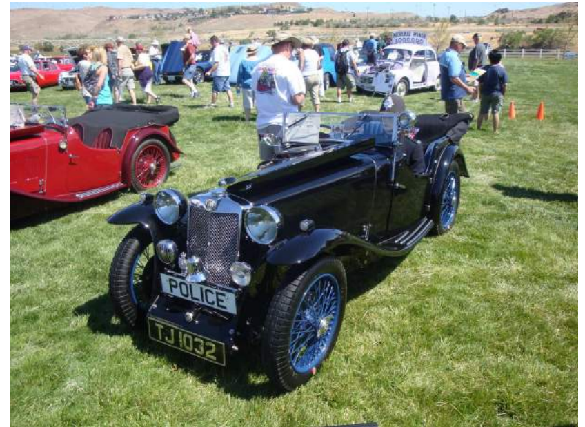
A classic police vehicle (above) and endless rows of MGs (below)