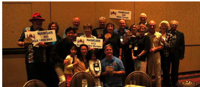
The MGOC contingent at the awards banquet