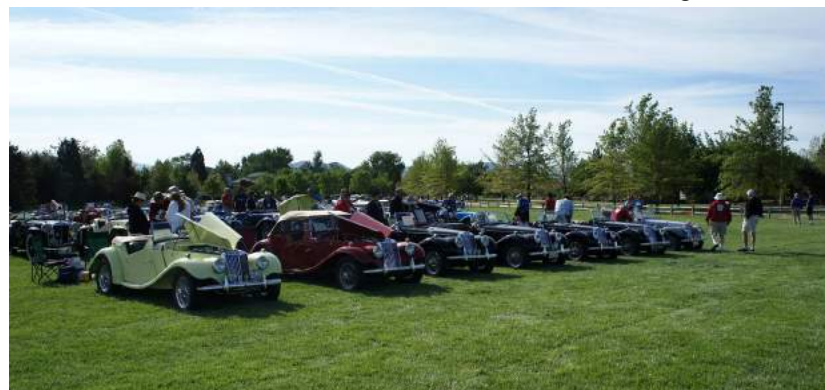
Cars on the show field on a beautiful day