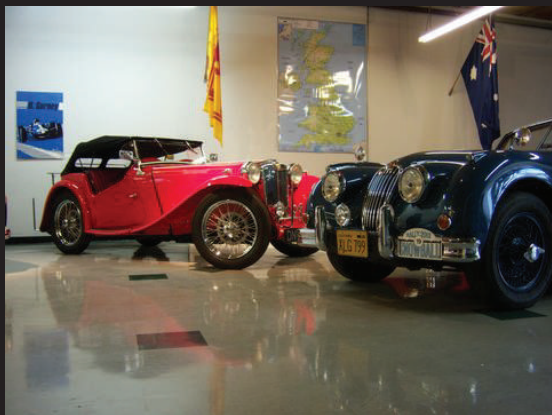
MG, Austin Healey, Jaguar, Triumph, Rolls/Bentley, Lotus

call now to talk about your dream... 408.782.1100