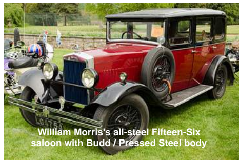
William Morris's all-steel Fifteen-Six saloon with Budd / Pressed Steel body

Although the partnership didn't work out, long story short, they became fully independent in 1935. By 1953, they became a power house. From Wikipedia and Pressed Steel Company, "In December 1953 Pressed Steel Company Limited