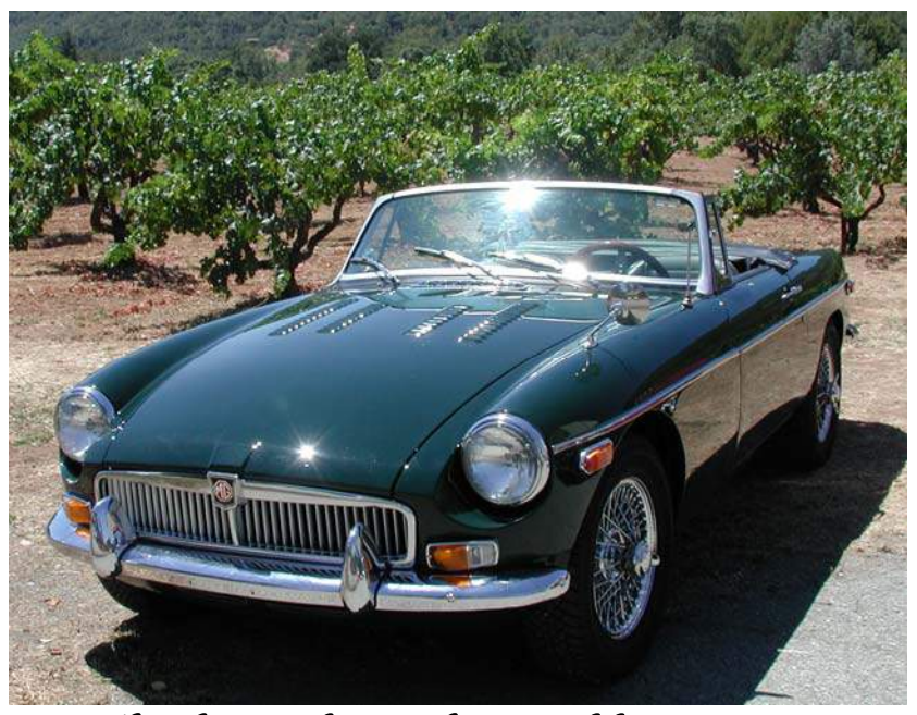
Thinking about that Rubber Bumper conversion for your MGB?

Come down to Morgan Hill and talk with the only shop that can do the entire job, bumper to bumper, under one roof. With a Morris Garage trained mechanic, and an in house body shop, our Moss Motors Distributorship gives us the ability to do a top quality job at a most competitive price. Check out the only all MG show room in Northern California when you visit!