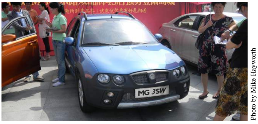
A new Chinese MG in Shenyang