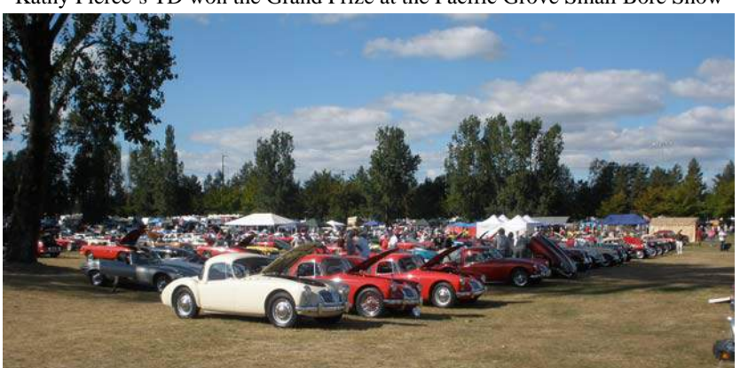
Vast rows of British cars at the Portland British Field Meet