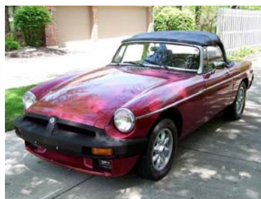
Win this 1978 MGB