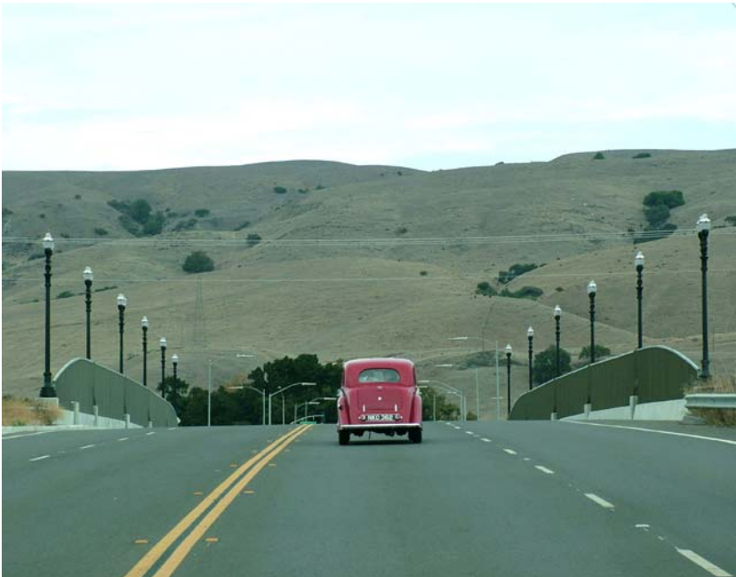
The happy couple rides off into the California hills

From Southbound I-880, take Davis St. exit and turn left on Davis. Travel 1.3 miles, then turn right on E. 14 th St. Travel 0.3 miles, and then right on Parrott Street.