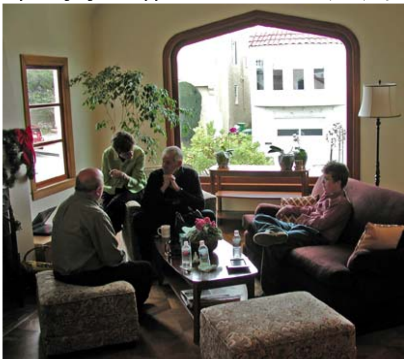
Guests enjoy the Holiday Tea illuminated by Elaine’s beautiful picture window