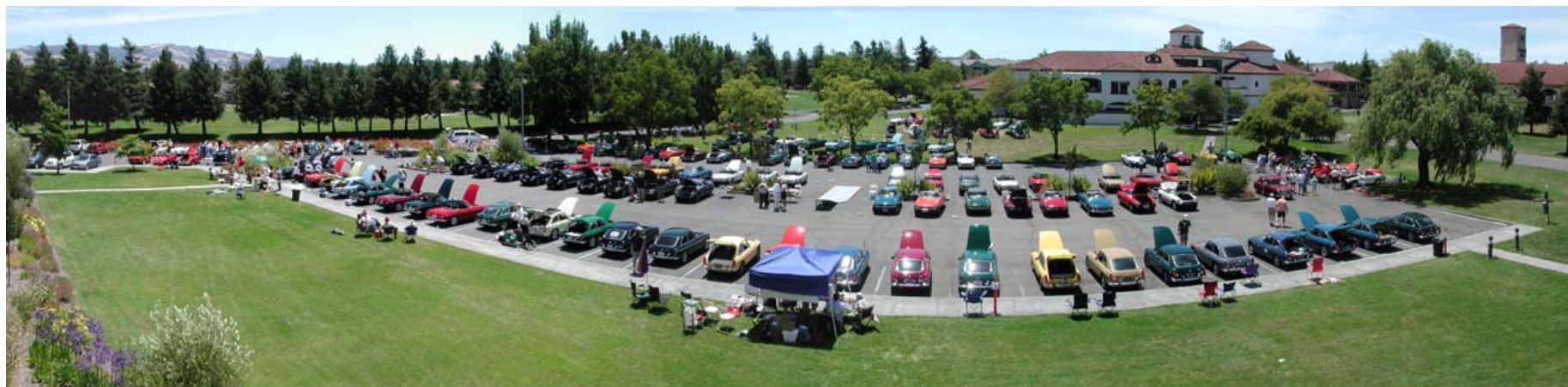
A view of the car show from a balcony of the Rhonert Park Doubletree (above)