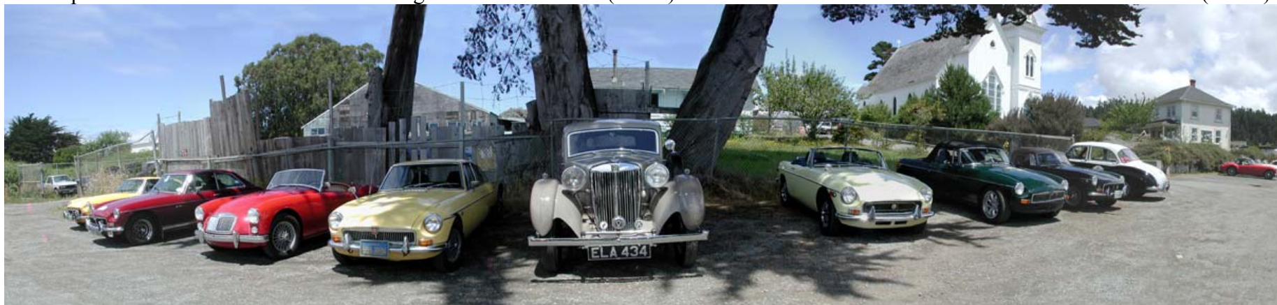
MGs at the terminus of the Mille de Mendocino (below)