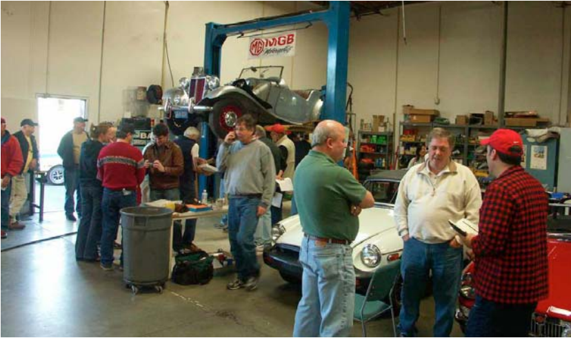
Lots of Nattering. More photos page 20 .