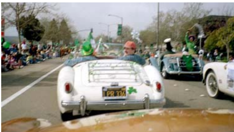
Club members in 2005 Dublin Parade. See page 17 .