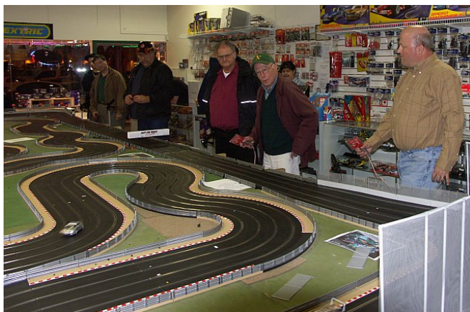
Racing through the hairpins and straight-aways at Slot Car Magic.