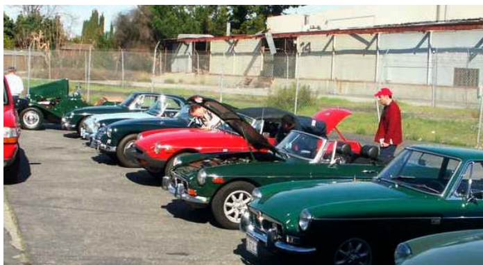
Fifteen or more MGs came out.