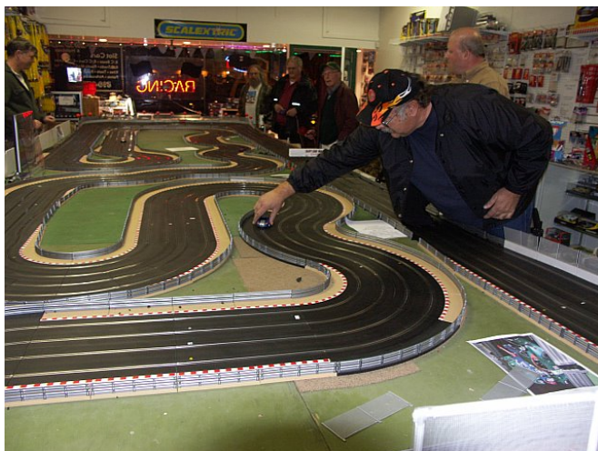
Not a single MG on the track!