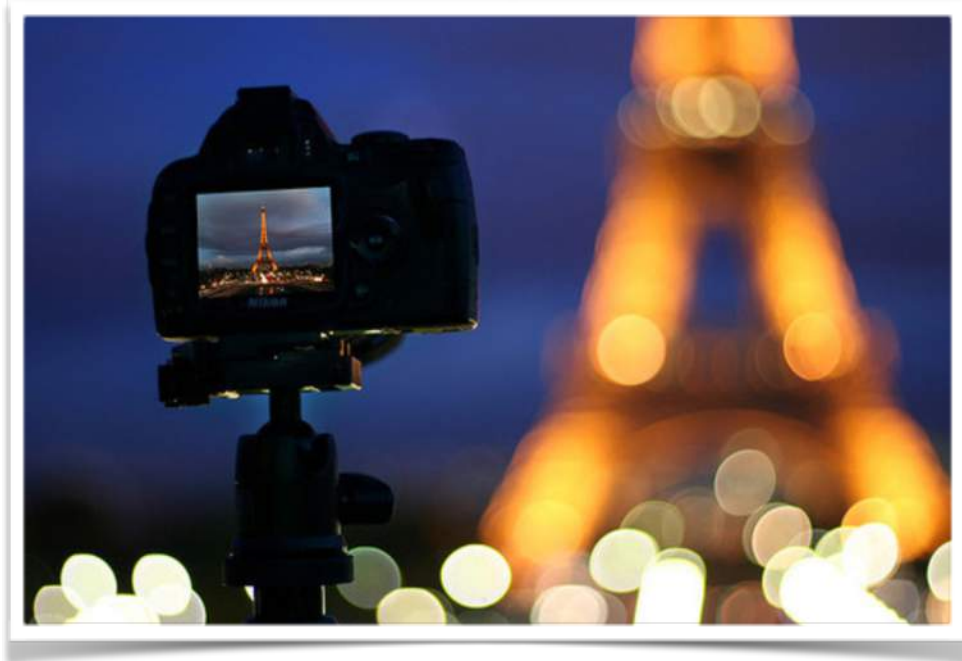
The Anonymous Frenchman's Camera