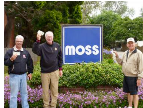
Getting ready to spend money at Moss

On the way back we drove along the Santa Ynez pass and stopped by the historic Cold Spring Tavern.