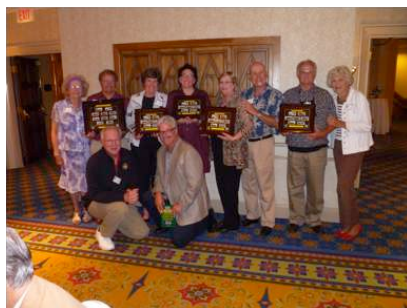
MGOC and SSTS Members & their Awards