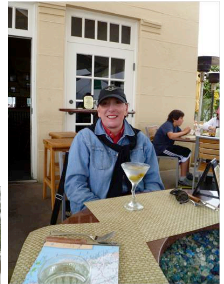
Lunch wharf side in Santa Barbara