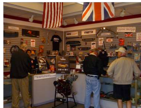
Spending money at Moss' Parts Counter