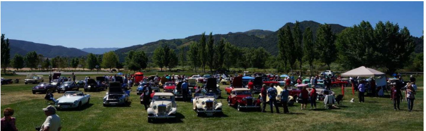
The Field at North Meets South

For your official MGOc 2016 Tour Planner link here: http://www.mgocsf.org/Portals/0/DOCUMENTS/Events%202016/MGOc%202016.compressed.pdf