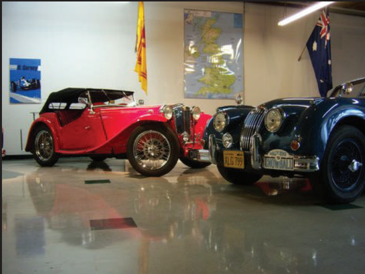
MG, Austin Healey, Jaguar, Triumph, Rolls/Bentley, Lotus

call now to talk about your dream... 408.782.1100