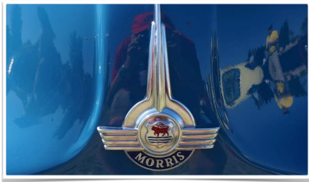
North Meets South Can you guess who took this photo? (hint: red cap)