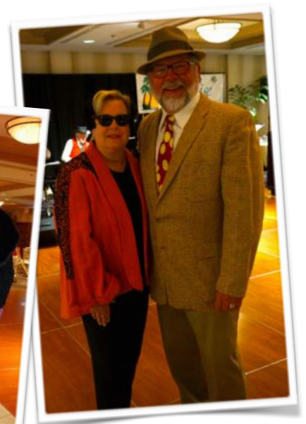
North Meets South 1940s Costume Finalists