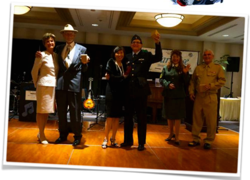
North Meets South 1940s Costume Finalists

1610 Middle Road, Calverton, NY 11933 631-369-9515, FAX 631-369-9516 Toll Free 800-882-77753 VISA, MD, DISCOVER, PAYPAL, COD