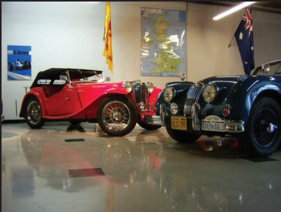
MG, Austin Healey, Jaguar, Triumph, Rolls/Bentley, Lotus

call now to talk about your dream... 408.782.1100