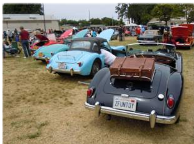
Very few MGAs at the show

I drove by '65 Blue MGB Roadster to the Dixon show today. Longest trip I have made in the car since I bought it.