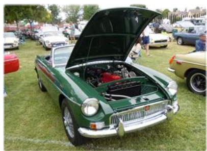
This Mk1 B looked a lot better than mine!