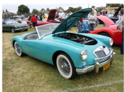
I liked this MGA 1500 as it looks like the ones used in the 1955 ads when the cars were introduced