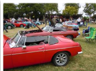
Row of MGBs (my car is the fourth one back in the row )