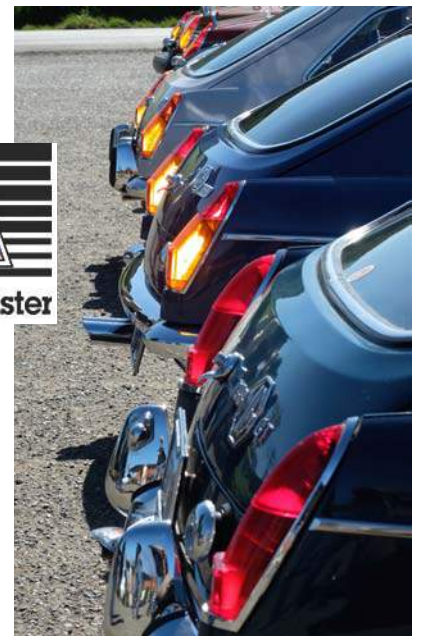
'Corn Beef 'Tour