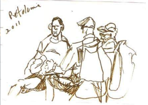
MG People Sketch by Nancy Shane, MGOC regional meet, Petaluma, 2011 - Recognize anyone?