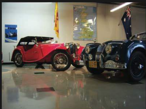
MG, Austin Healey, Jaguar, Triumph, Rolls/Bentley, Lotus

Type to enter text call now to talk about your dream... 408.782.1100