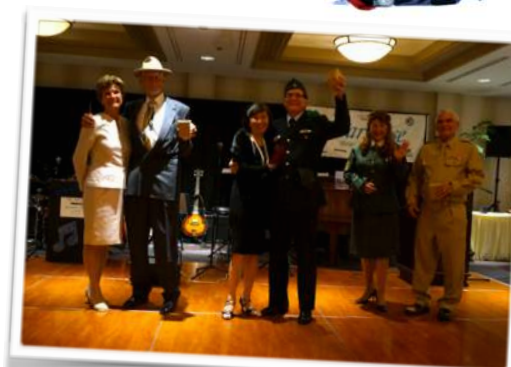
North Meets South 1940s Costume Finalists