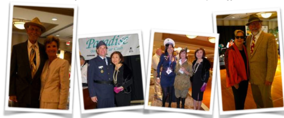
North Meets South 1940s Costume Finalists