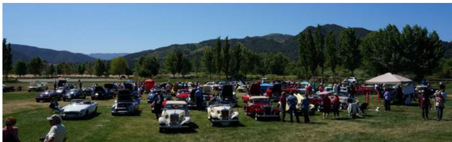
The Field at North Meets South

For your official MGOC 2016 Tour Planner link here: http://www.mgocsf.org/Portals/0/DOCUMENTS/Events%202016/MGOC%202016.compressed.pdf