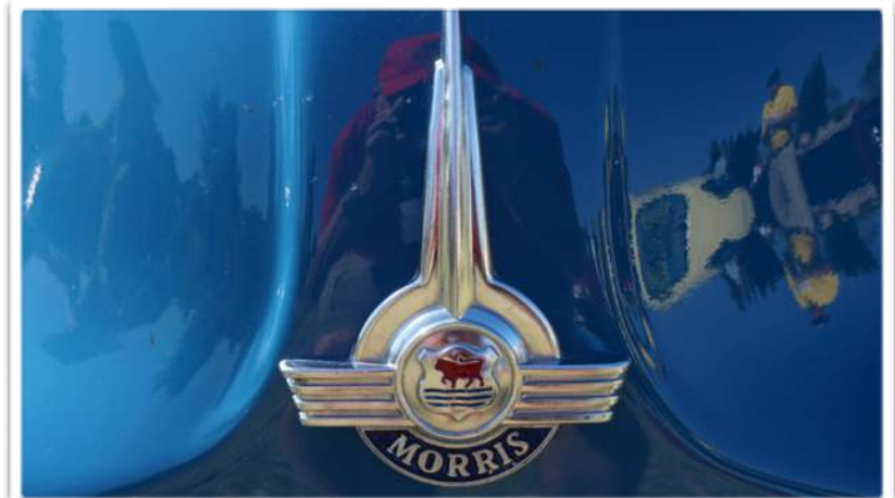
North Meets South Can you guess who took this photo? (hint: red cap)