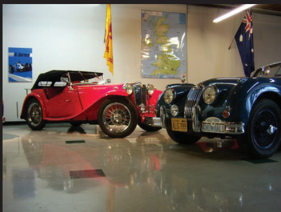
MG, Austin Healey, Jaguar, Triumph, Rolls/Bentley, Lotus