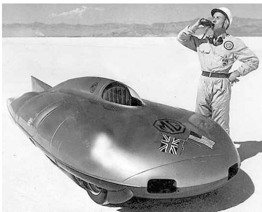
Stirling Moss and MG EX 181 at the Bonneville Salt Flats.

Directions: Take Hwy 85 south of I-280 and Hwy 101 in San Jose. From 85, exit at Almaden Expy. and go south. (The ramps can be a bit tricky.) Go south on Almaden 4 or 5 miles. After the light at Via Valiente take a right at the next light, Almaden Rd. Go ½ mile and turn left on Micro Pl. (Sign is hard to see. It is right after new homes on your right.) Make an immediate left on Carnival and then another left onto Silver Lode.