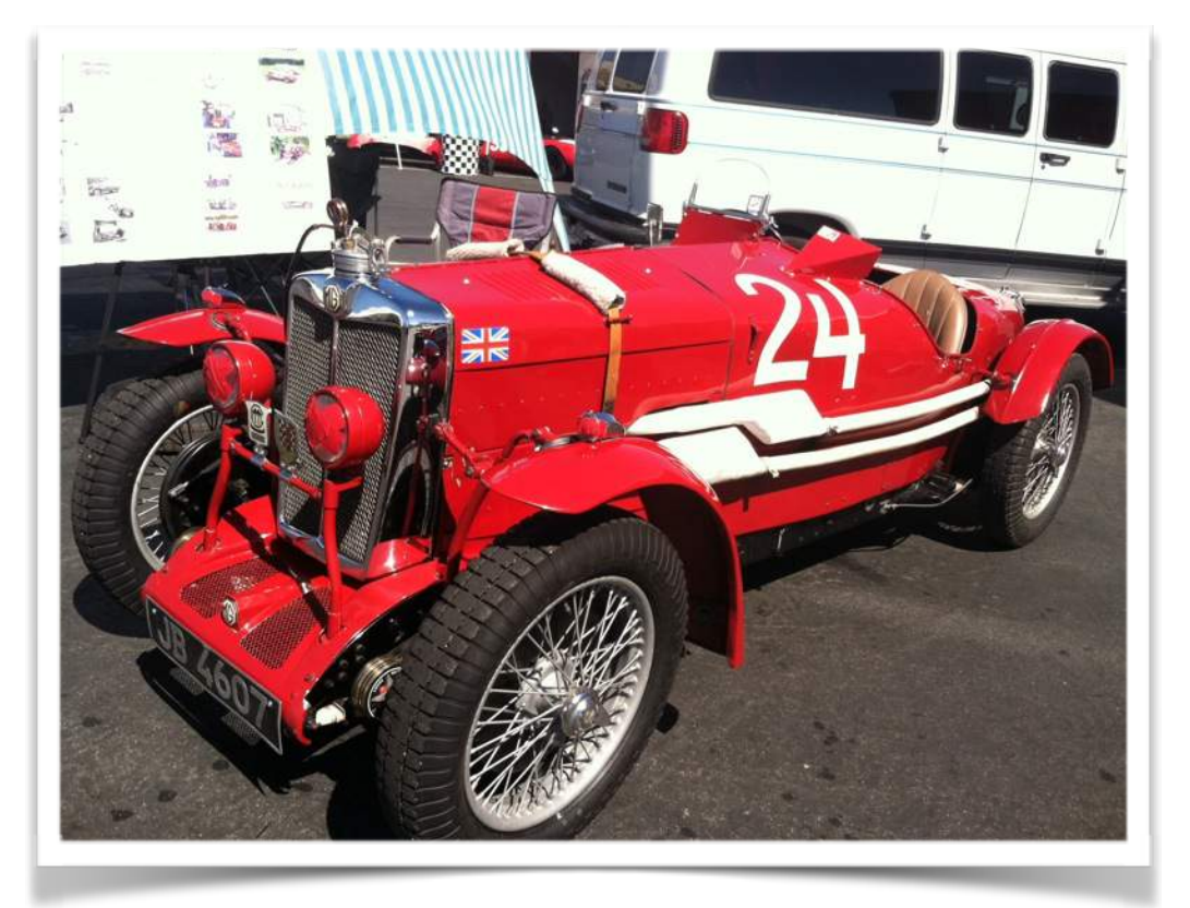
Recently spied 1934 NE at the Rolex Monterey Motorsports Reunion during Monterey Week