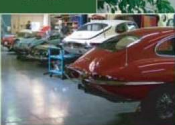
Come Visit our Showroom of Classic British Cars.

Distributors: Moss Motors ARP Performance Fasteners Glasurit Paints VTO Wheels Pierce Manifolds Distributors