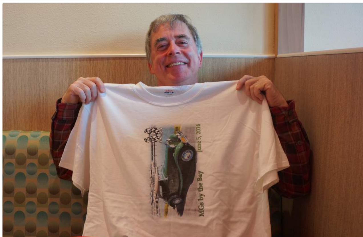
Planning for MGs by the Bay 2016, "What could possibly go wrong?"