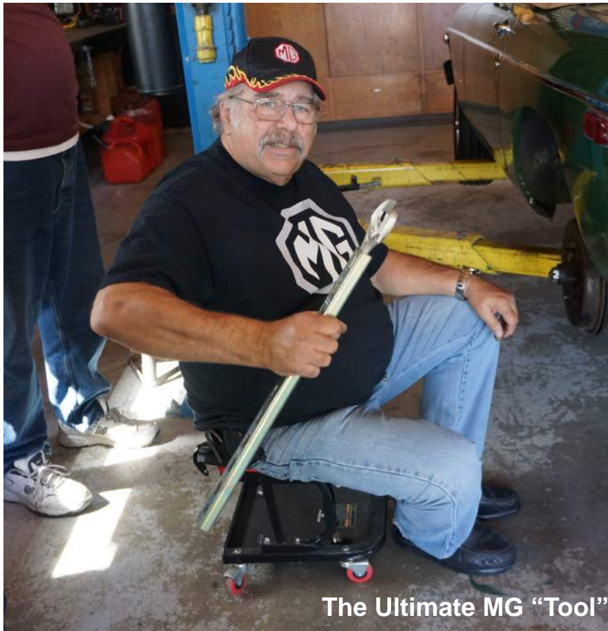
The Ultimate MG "Tool"