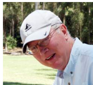
Driving the backcountry roads of Carefree, AZ