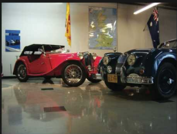
MG, Austin Healey, Jaguar, Triumph, Rolls/Bentley, Lotus