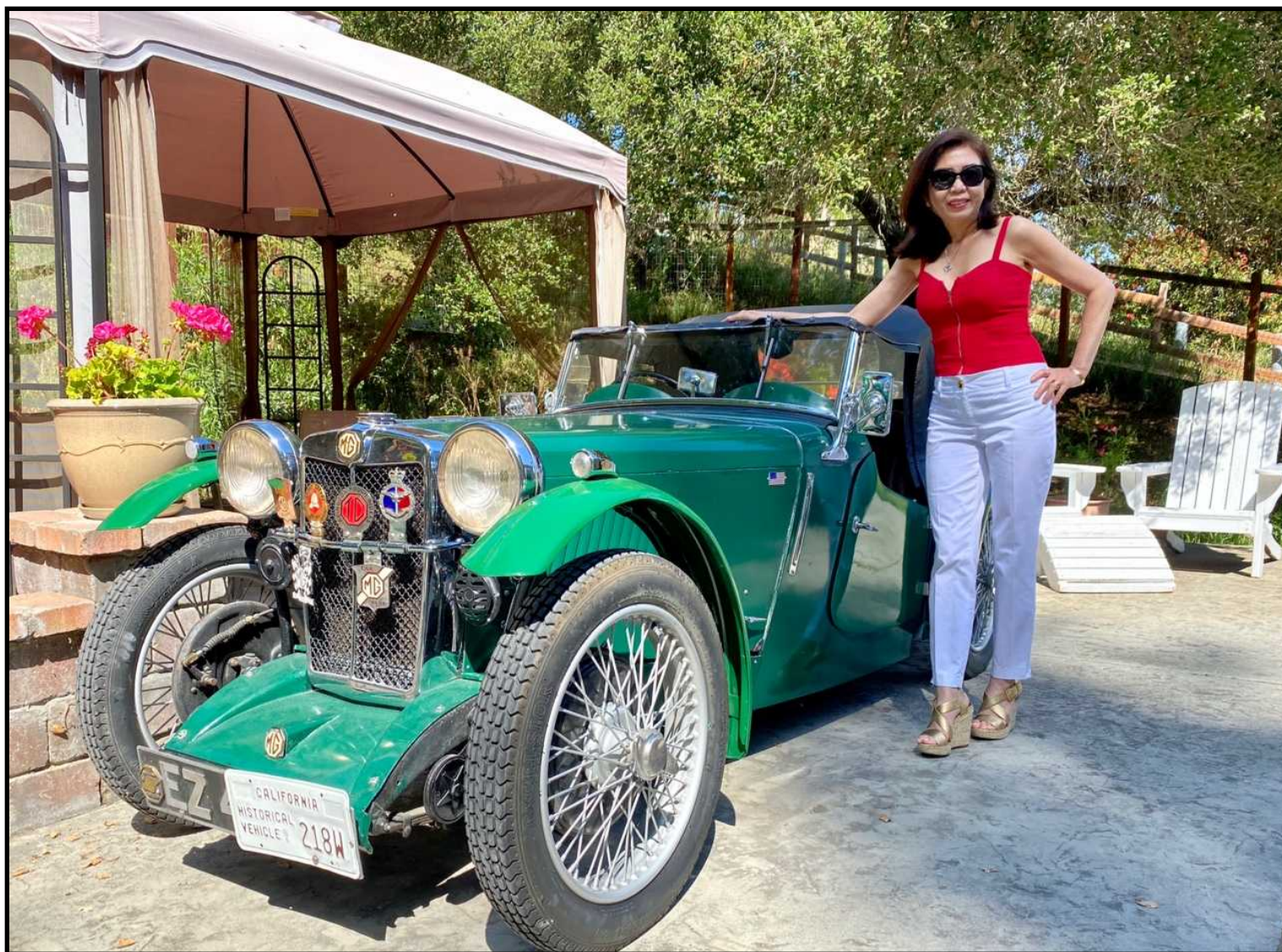
Dan's 1935 MG after conversion to front cycle wings. Model by Thuy