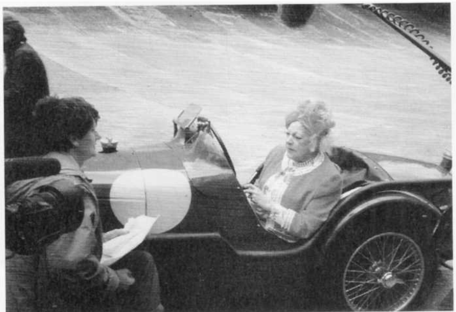
Barbara Cartland in C0261 at Brooklands

OMG that pink jacket sleeve is so close to the exhaust pipe! The hat appears to have come off.