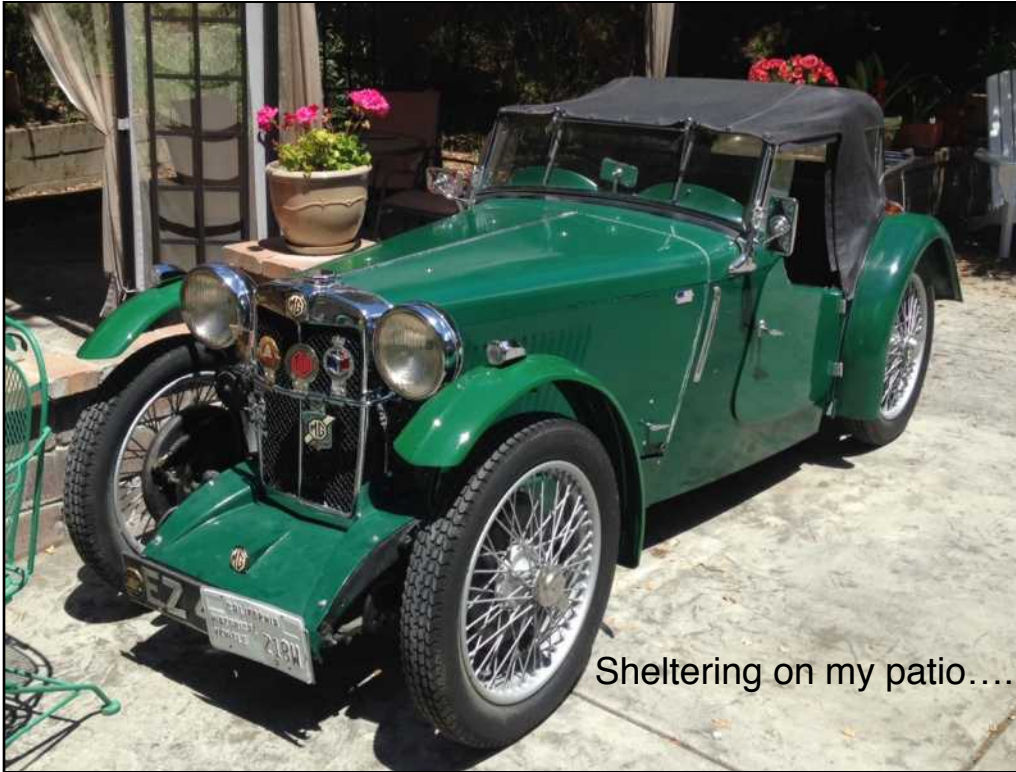
Sheltering on my patio....

Door color not quite the same. Glossier with the clear coat. Cycle wings a different color yet.