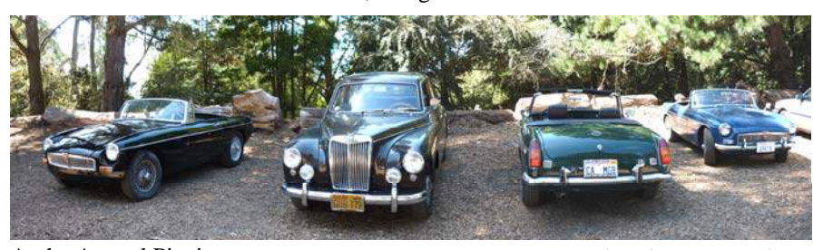
At the Annual Picnic

Oct. 17 - California Autumn Classic, Morgan Hill