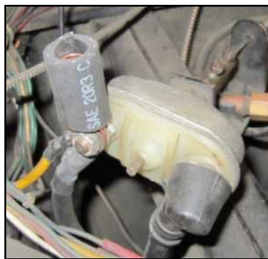
Figure 5 – The Lug Insulated

The air hose covers the switch and lug, but there's still enough room that the lug doesn't touch anything, and with the air hose's flexibility it's easy to reach the lug, remove the insulator, and connect a cable. Now if I want to jump-start a car or have mine jumped I won't have to uncover the battery. You could also do something like this on a B or C, but the lug would have to be down at the starter and that's not as convenient.