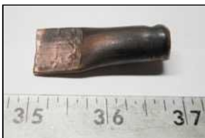
Figure 2 – The Crimp