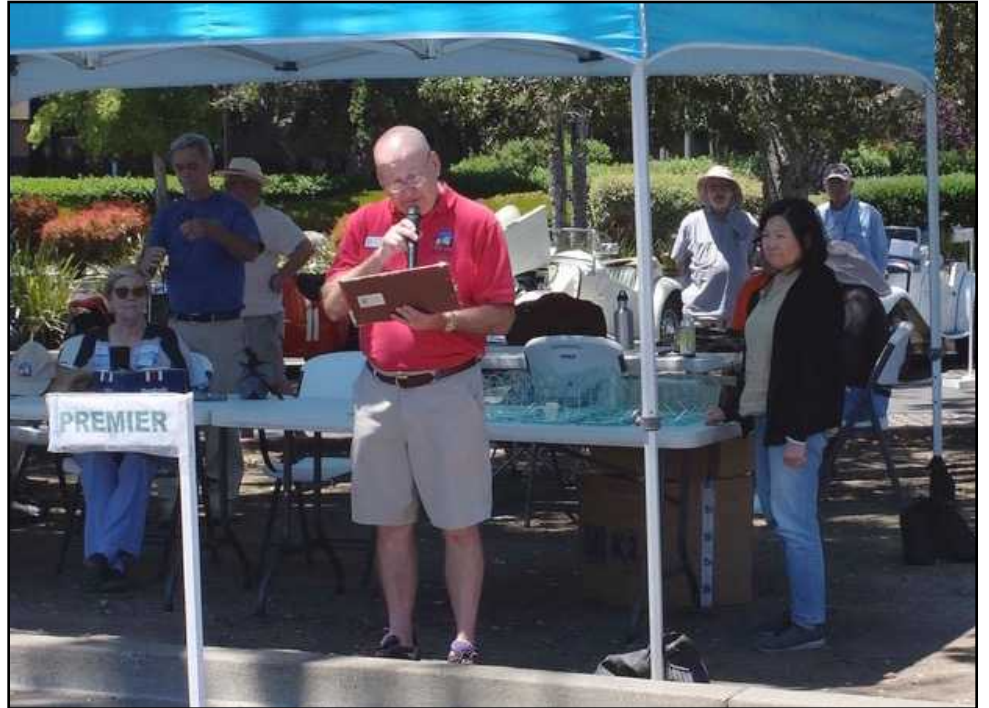
Rayman photos below