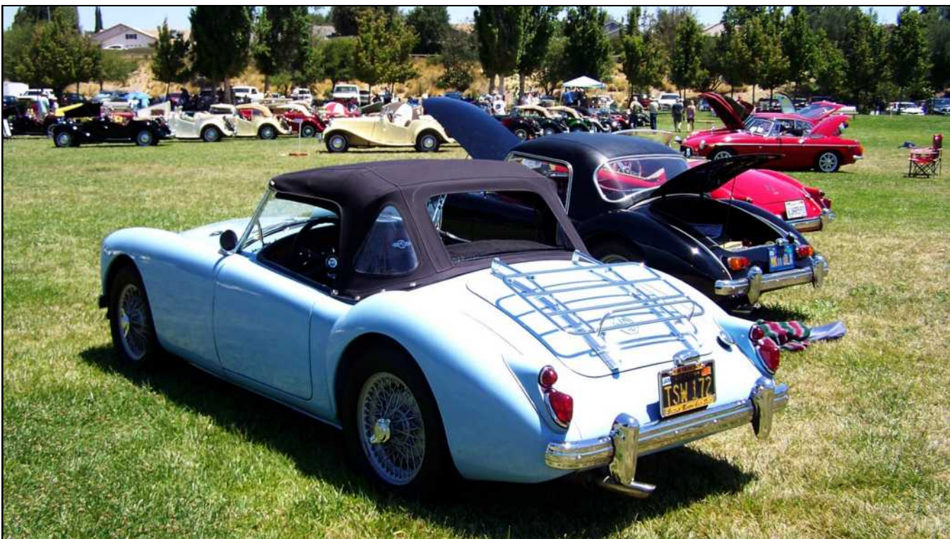
MGA tail view of the show field.