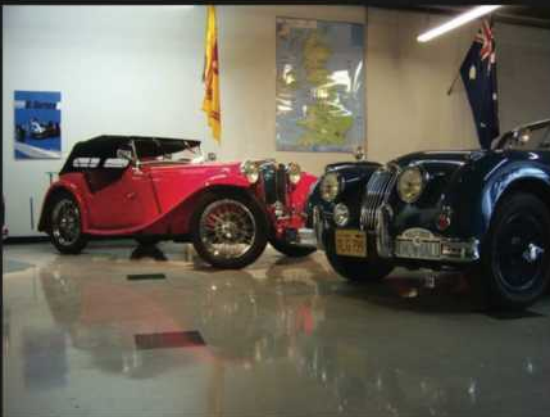
MG, Austin Healey, Jaguar, Triumph, Rolls/Bentley, Lotus

call now to talk about your dream... 408.782.1100