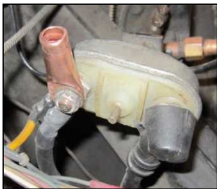
Figure 4 – The Lug Installed