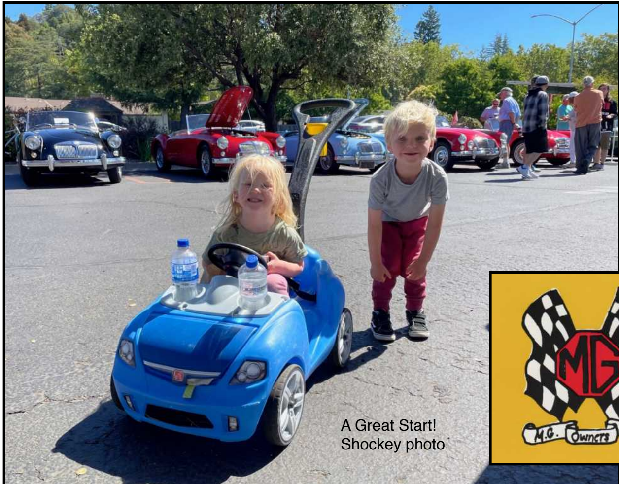
A Great Start!