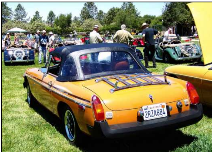
Hollander MGB at show