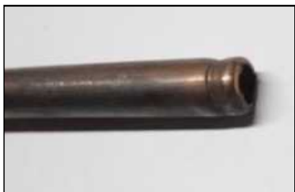
Figure 1 – The Tube

I had clear access to the switch since the air hose was out of the car. While the battery was out of the car I removed the nut and washer on the hot side of the switch, placed the lug over the stud, and reinstalled the nut and washer – Figure 4. The final step was to slip that short piece of hose over the lug to insulate it