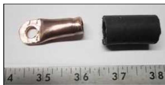
Figure 3 – The Lug and Insulator