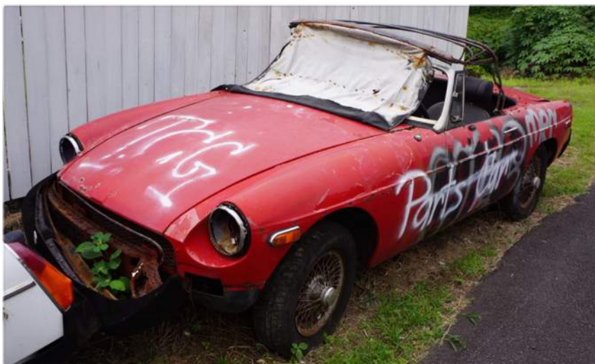
in Maui

The MGOC Board will chose the top finalists, which will then be revealed in the following month’s edition of The Octagon