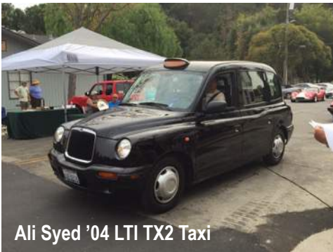
Ali Syed '04 LTI TX2 Taxi