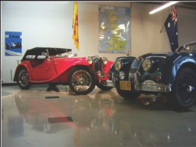
MG, Austin Healey, Jaguar, Triumph, Rolls/Bentley, Lotus

call now to talk about your dream... 408.782.1100