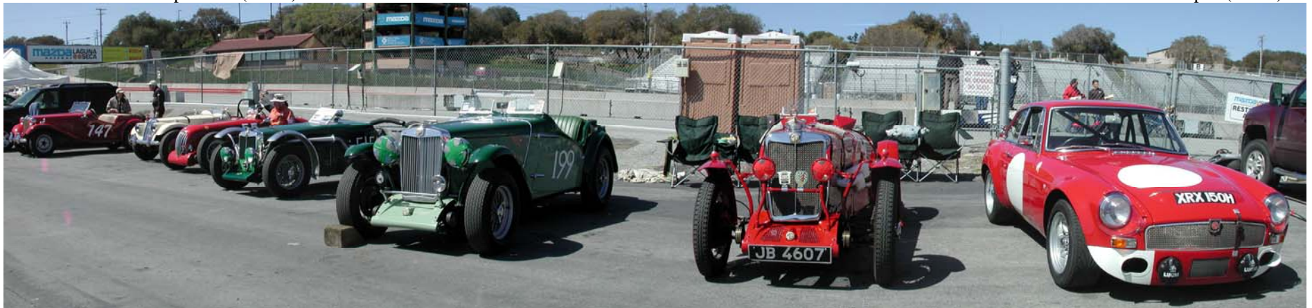
Lining up for the MG only vintage race (below)