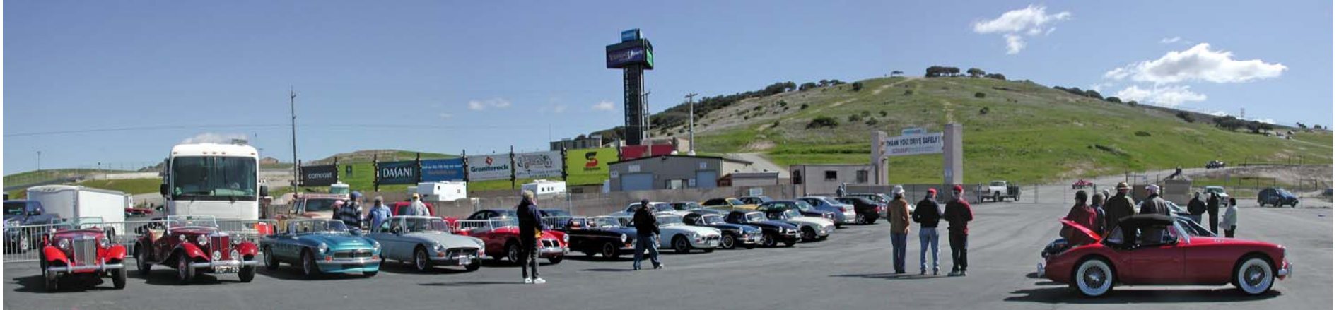
Rows of MGs in the paddock (above)