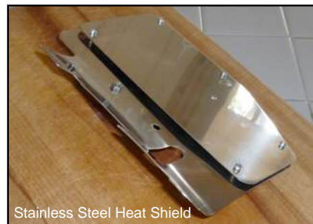
Stainless Steel Heat Shield

Hello Again. On May 11 th Ken Gittings lead the club on a fun tour up Mt. Hamilton. I had a little more excitement than most on that trip, as my new heat shield—made of a composite plastic/fiber material, partially melted during the drive. The good news is that the only collateral damage was to my air filter (whose rubber gasket melted). In late model MGBs, the heat shield protects the carburetors from the extreme heat of the catalytic converter, so failure can have far more serious consequences ... like engine fire. Since my original MG factory heat shield lasted over 33 years, before I elected to replace it for cosmetic reasons, and this new one lasted only hours, I wrote a complaint to the vendor. They pointed out that the problem could have been excessive heat, due to either a plugged catalytic converter, or an enriched fuel mixture. But, when I responded that my car was in good condition and that I'd recently had the mixture professionally adjusted by none other, John Twist, they promptly and courteously, agreed to a refund. What can I say?, "Name dropping" doesn't usually work, unless the name is John, John Twist! I also searched the internet to see what other solutions might be available and found Victoria British which, in addition to selling the same composite plastic/fiber heat shield, sold a far more robust stainless steel shield for double the price.