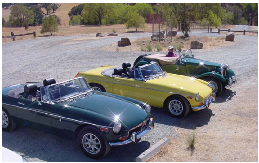
MGs at Round Valley Regional Park

Reaching Walnut Creek, we picked our way eastward through traffic lights and fortunately only a little traffic. The small group managed to make it through all the lights without splitting up. In Clayton the route headed southeast and into the rolling hills around Mt Diablo. Marsh Creek Road soon narrowed to two lanes and became twistier as the miles passed. As if by magic, the clouds disappeared as the road narrowed and the speed picked up. Cruising through Dark Canyon and Long Canyon at the base of Devil Mountain we made it to Round Valley Regional Park, which was approximately the halfway point of the Tour. A picnic lunch under a big shade tree was perfect except for a few yellow jackets buzzing around the table.