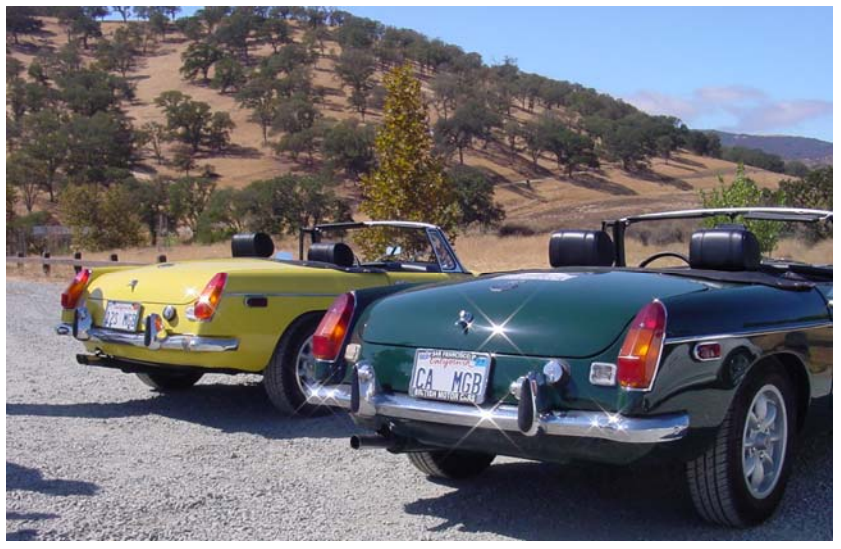
Bob and Ryan's MGBs set against the East Bay Hills

After a few required pictures in the parking lot, we returned to our cars and the near deserted back roads of Contra Costa County. We finished off the remainder of Marsh Creek Road and Camino Diablo (Road of the Devil) before turning onto the more populated Vasco Road. It led us through more rolling hills, topped by windmills, and south into the Livermore Valley. Just before reaching civilization, we turned west into the flat farm land of North Livermore. A few more rights and a few more lefts in the wide open spaces led us to the valley surrounding Highland Road. As the straight roads gave way to more twists and turns we reached the end of our tour in Danville, almost right where we started.