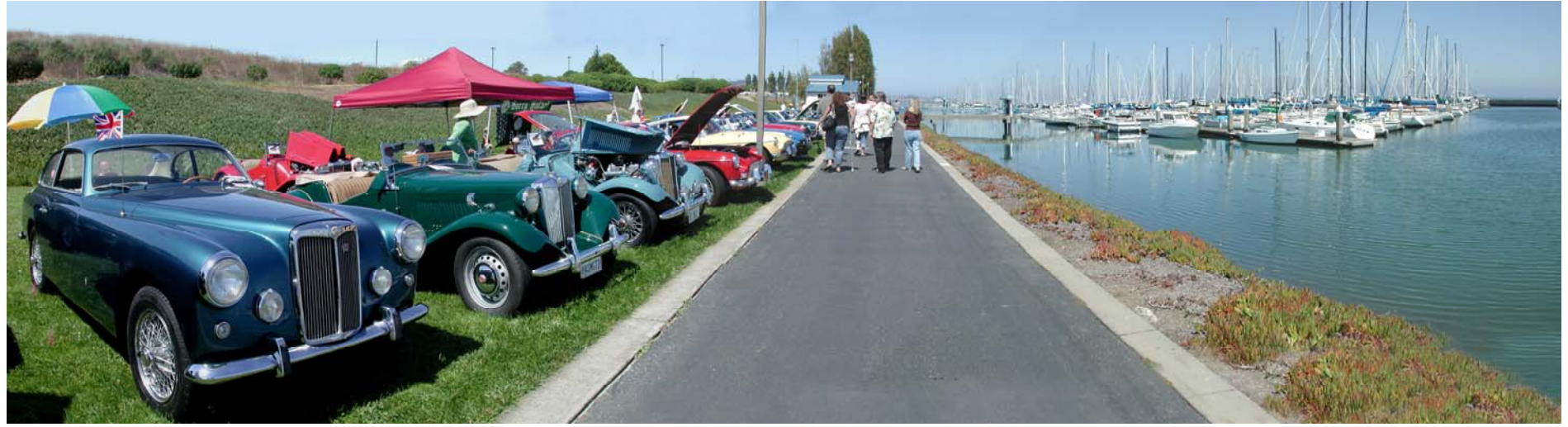
MGs on the grass opposite the marina (above)