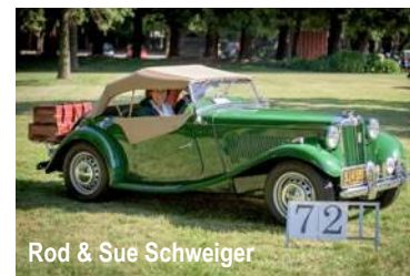
Rod &amp; Sue Schweiger