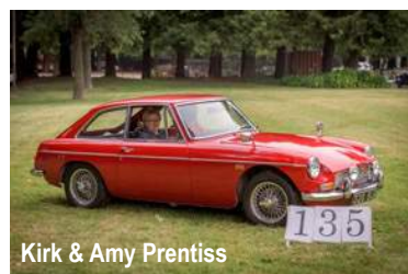
Kirk &amp; Amy Prentiss