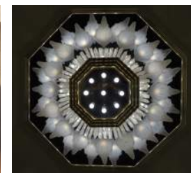
Photo of Octagon Chandelier, in the Rohnert Park DoubleTree Ballroom