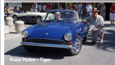
Ross Hulse - Tiger