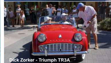
Dick Zorker - Triumph TR3A