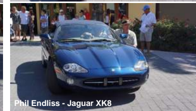
Phil Endliss - Jaguar XK8