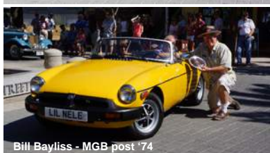
Bill Bayliss - MGB post '74