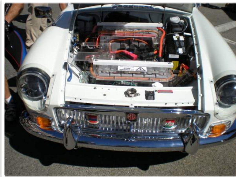
Move over Tesla, recently spied All Electric MGB GT