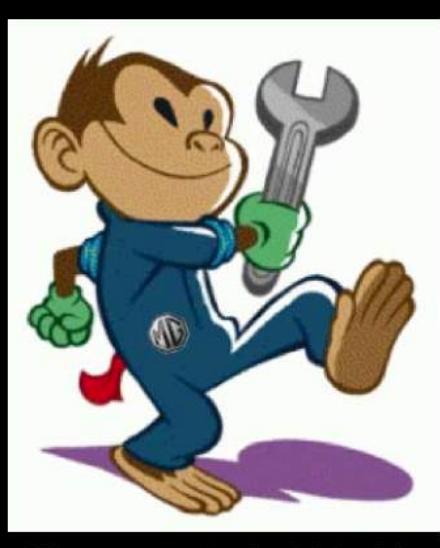
What my mechanic thinks I do