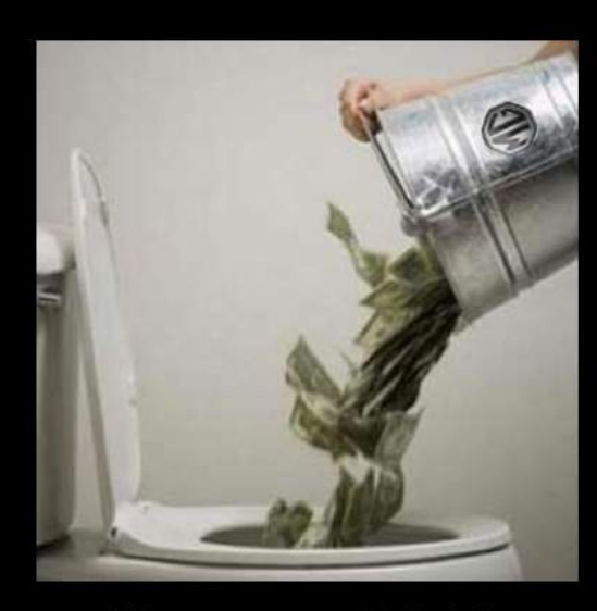
What my spouse thinks I do