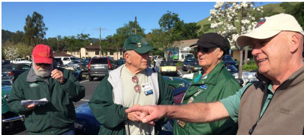
Photos in the shape of a 3 Leaf Clover