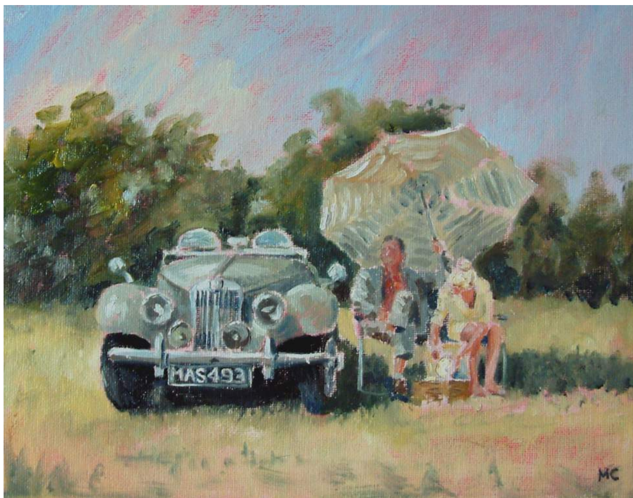
MG with a Picnic