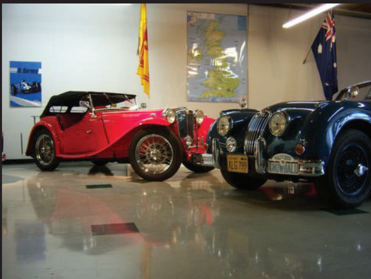
MG, Austin Healey, Jaguar, Triumph, Rolls/Bentley, Lotus

call now to talk about your dream... 408.782.1100