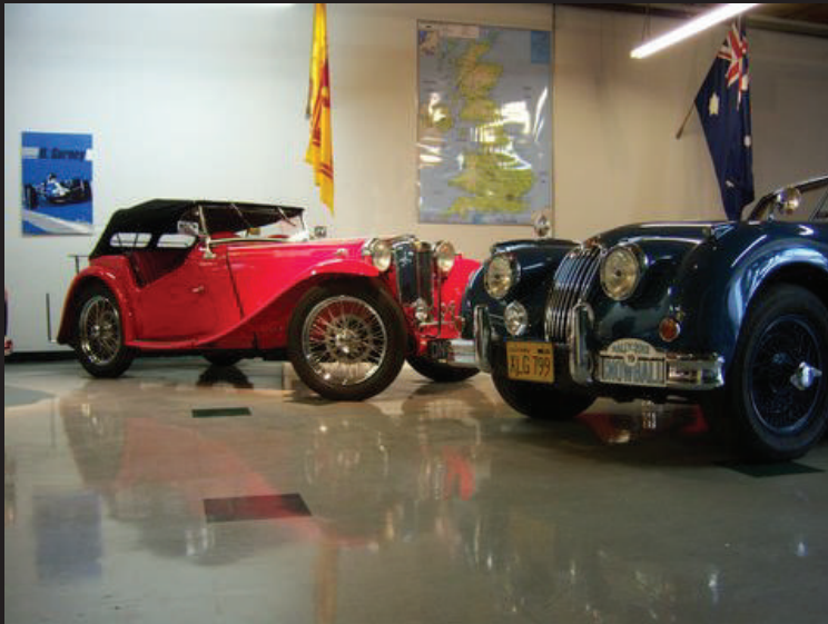
MG, Austin Healey, Jaguar, Triumph, Rolls/Bentley, Lotus

call now to talk about your dream... 408.782.1100