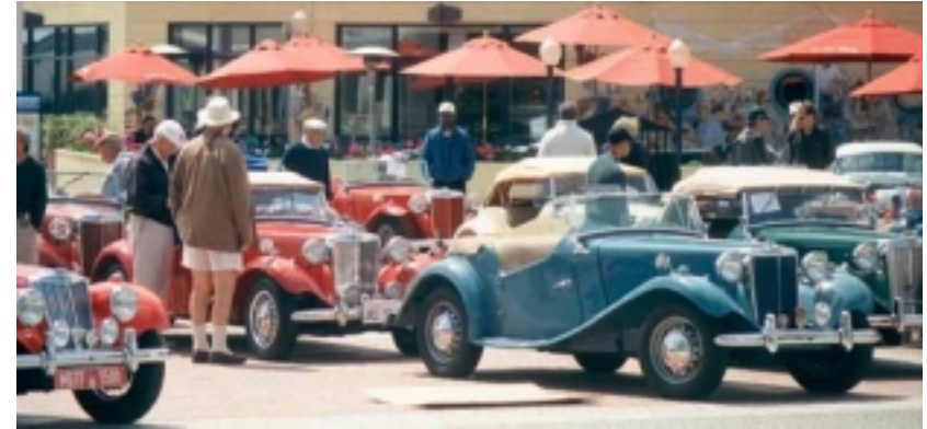
T Series MGs at Jack London Square, 2001

When I finally did browbeat my father into letting me buy (not buying for me) a car, it was a very mundane four-year-old Ford Falcon. I didn't finally get my hands on an MG until I was twenty-two years old and moved away from home. I roomed with a friend who had a beat up MGB/GT. I drove it some and liked it enough that I bought a used MGB roadster. Though it was sometimes a love/hate relationship, the MGB was a very fun car. When shopping for the MGB I toyed with the idea of buying a TD, a good one was about the same money. I just didn't think I could drive one as an only everyday car. I didn't work on the MGB then because a TC owner I knew would work on my MGB for almost nothing. His TC was rough, but had a fresh engine he had rebuilt. I drove his TC once and that experience eliminated the TC from ever being a consideration. After my MGB, the TC felt like a horse and buggy, and all over the road. If I ever bought a T series it would have rack and pinion steering like the MGB. The TCs in those days were not restored like the ones you see today. Those rough TCs always looked to me wispy and about to self-destruct compared to a TD or TF.