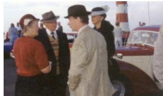
Should we try period dress for an event in 2004? (Cornish Run, 14 Sept 2003) Come to the planning meeting on Jan. 31 or send your ideas to a club officer.

(Rover has also launched its V-8 powered, rear-drive saloon and estate cars, the ZT and ZT-T 260. Called the ultimate antidote to an anodyne world.)