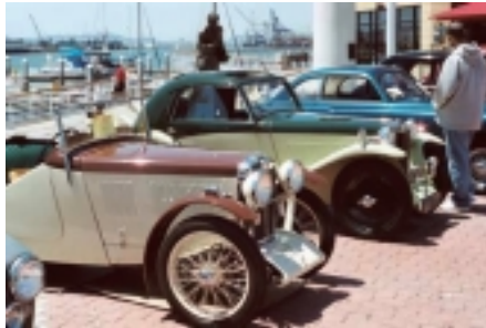
Steneberg J2, McClure PA Airline Coupe, Jack London, 2003, Shockey