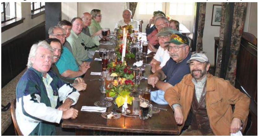
Dining at the Pelican Inn