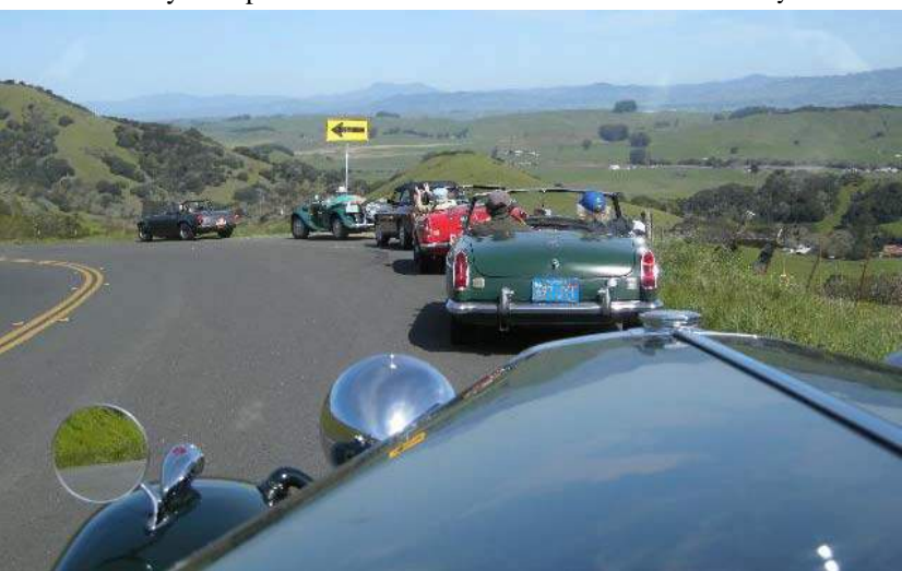
Pausing at a scenic overlook