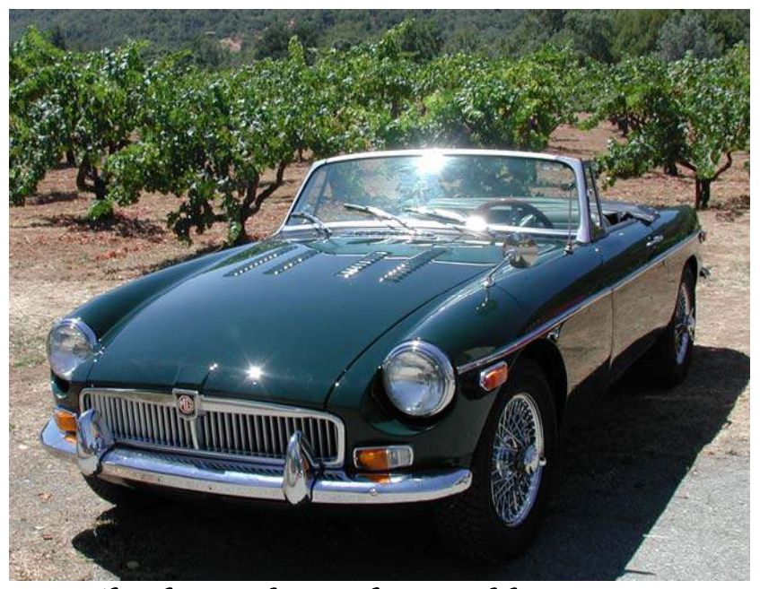
Thinking about that Rubber Bumper conversion for your MGB?

Come down to Morgan Hill and talk with the only shop that can do the entire job, bumper to bumper, under one roof. With a Morris Garage trained mechanic, and an in house body shop, our Moss Motors Distributorship gives us the ability to do a top quality job at a most competitive price. Check out the only all MG show room in Northern California when you visit!