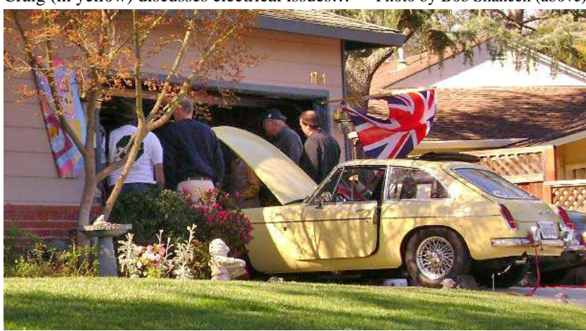
with the rapt crowd.