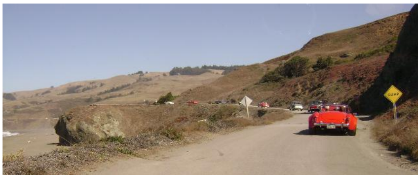
The Waves to Wine Tour leaves the beach