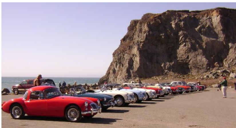
Lined up at Goat Rock Beach

Sunday morning began with a buffet breakfast at the hotel and goodbyes between new friends as everyone started heading home. Will we do it again next year? Time will tell. Meanwhile, watch this space!