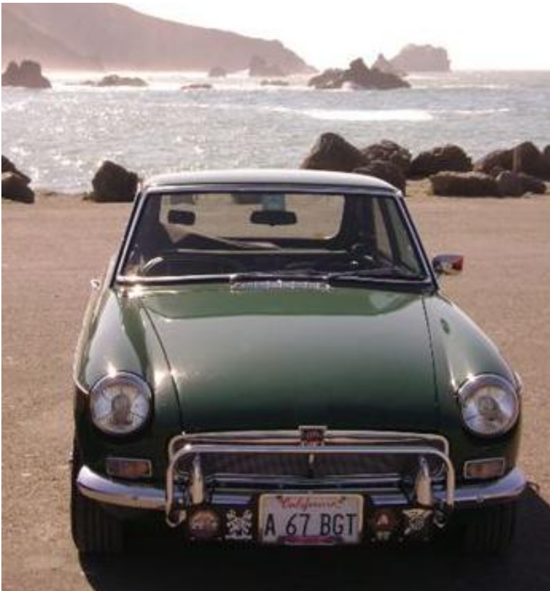
Ken Gittings' MGB GT at Goat Rock Beach