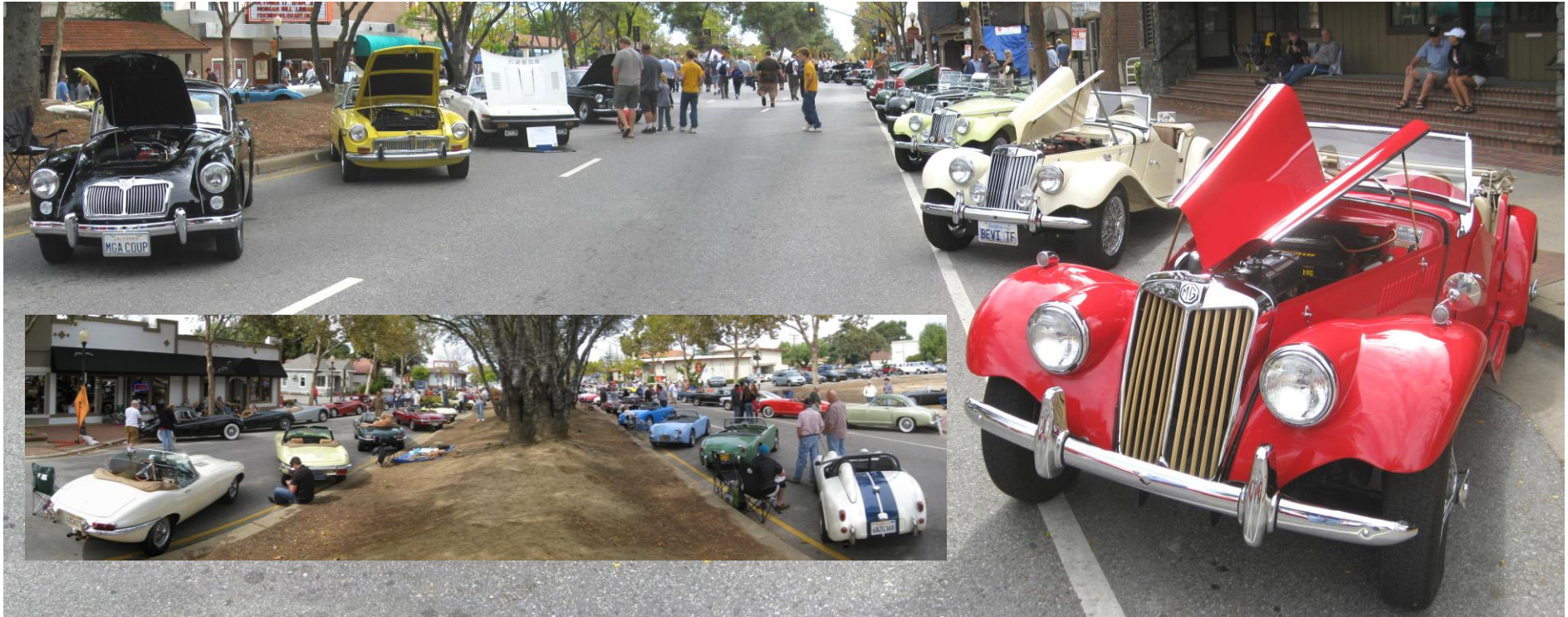
On Morgan Hill's Monterey Road: a row of MGs (above), a view from the median (inset), Sunbeams and Sprites (below)