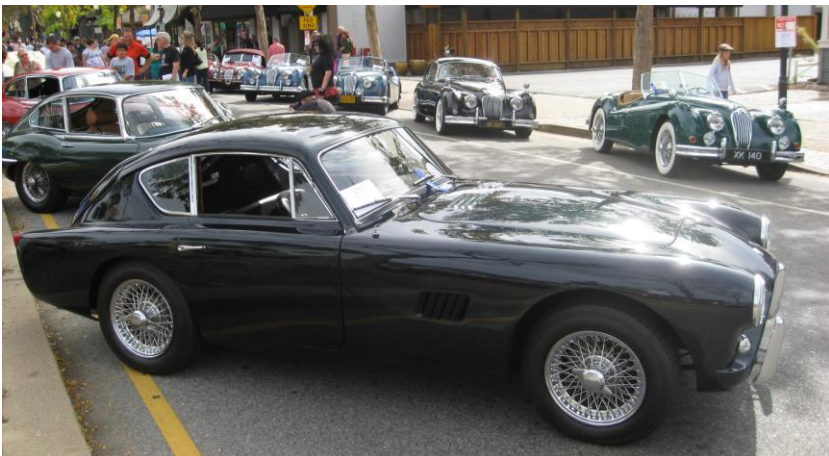
Jaguars at the California Autumn Classic

More Information: http://www.vintagemg.com/parts_exchange_info.htm