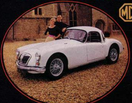
1957 MGA. FIRST OF THE NEW GENERATION, ENVELOPE-BODY MGs.