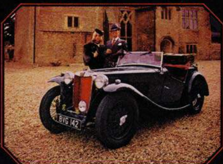
1945: MG TC. THE SPORTS CAR AMERICA LOVED FIRST.