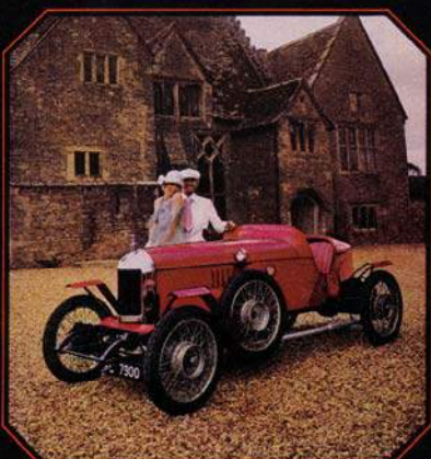
1925 "OLD NUMBER ONE." GOLD MEDAL IN 1925 LONDON-TO-LAND'S END.