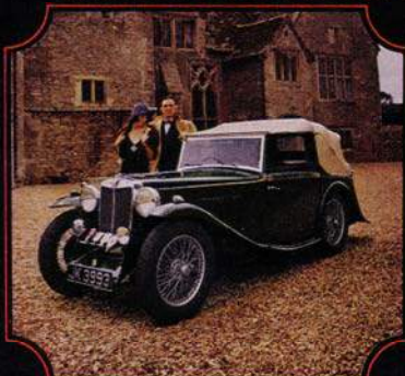
1934 MG NA MAGNETTE. IT HAD COACHWORK BY MALTBY'S LTD.