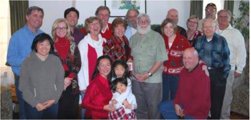
MG Owners at the Holiday Tea (above)