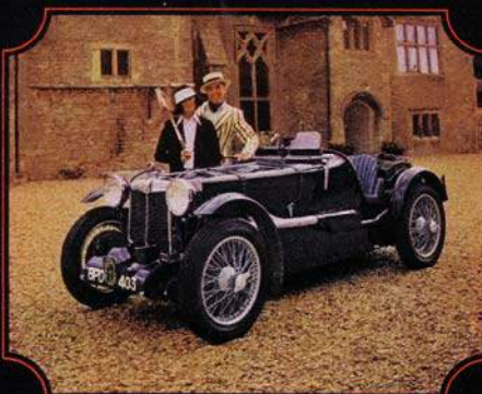
1933 MG K-3 MAGNETTE. #1 AND #2 IN CLASS. 1933 MILLE MIGLIA.

Everything MG has learned in 50 years of building sports cars is summed up in this most exciting of all MGs.