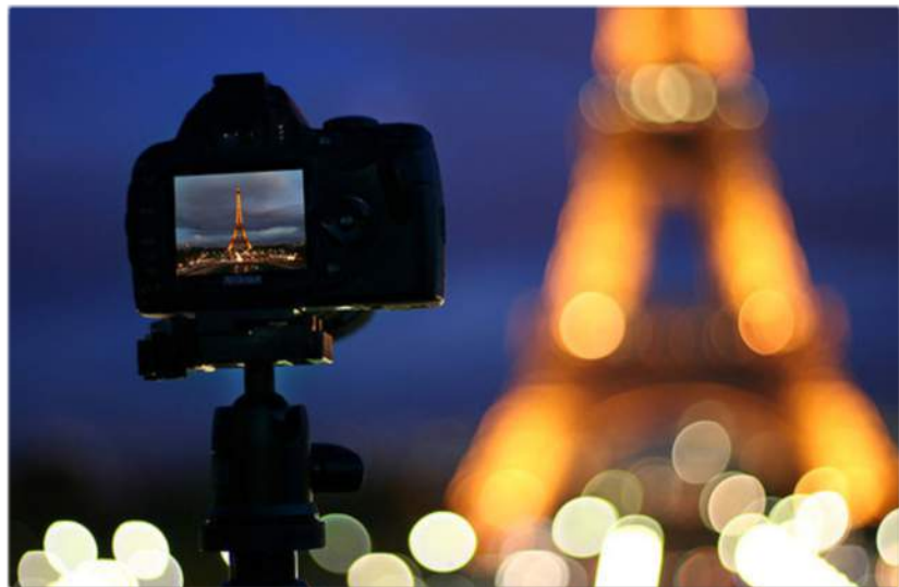
The Anonymous Frenchman's Camera