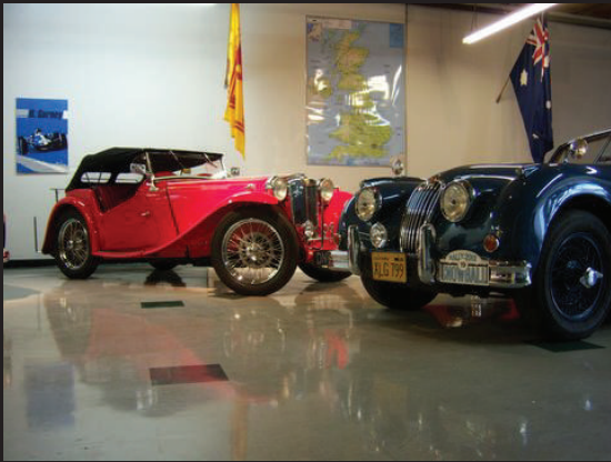
MG, Austin Healey, Jaguar, Triumph, Rolls/Bentley, Lotus

call now to talk about your dream... 408.782.1100