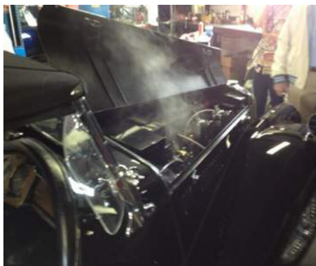
where there is smoke there is .... an MG