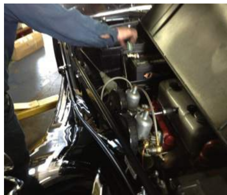
Clint demonstrates why we have emergency battery disconnect switches