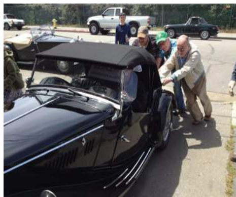
getting a little help from my friends

technically speaking ... it is NOT a "Breakdown"