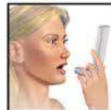
Take a deep breath

So hopefully, we all take these simple lessons from kindergarten to heart, so you too, can suck, squeeze, bang and blow like a Pro!