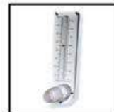
Record the reading on your meter