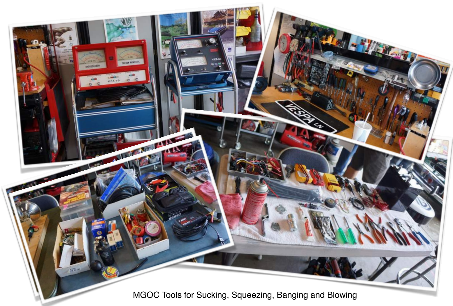
MGOC Tools for Sucking, Squeezing, Banging and Blowing