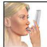
Suck, Squeeze, Bang and Blow as hard as you can