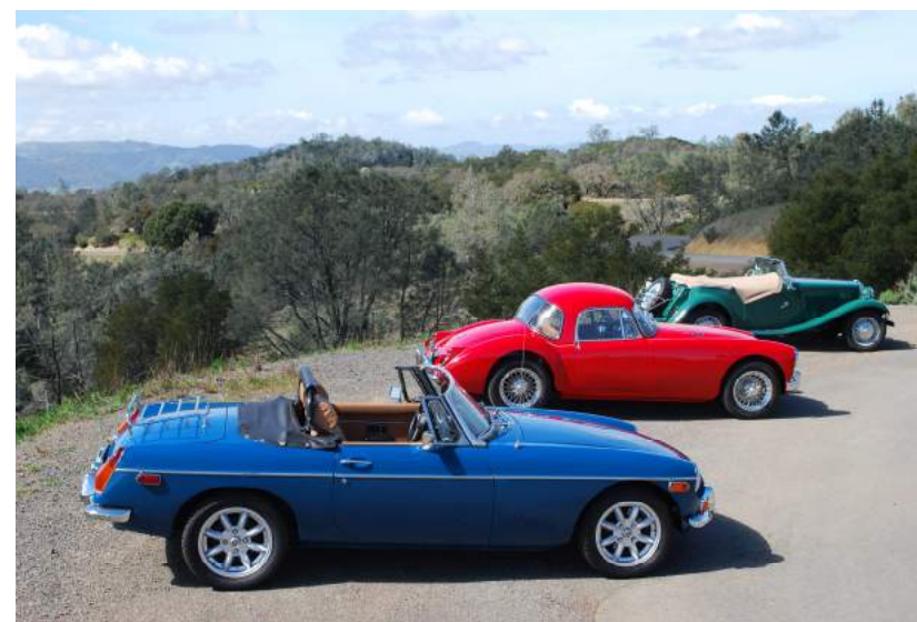
MGs by the Bay poster photo shoot