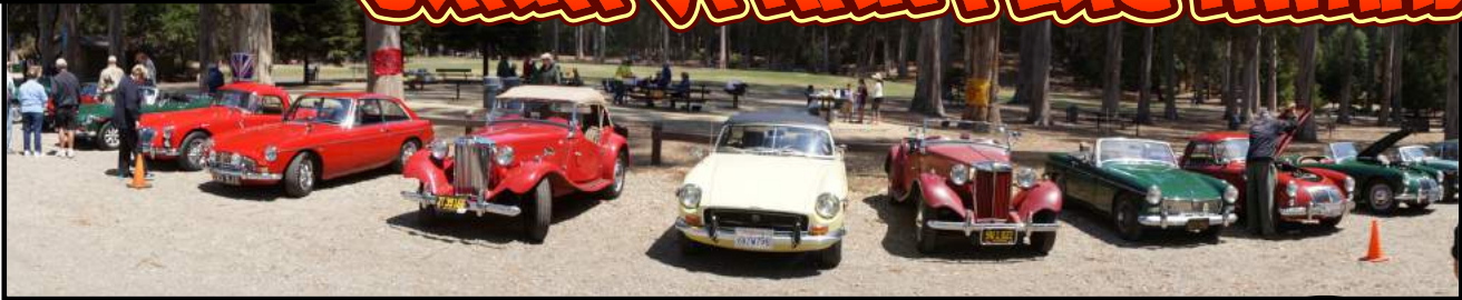
MGOC ANNUAL PICNIC