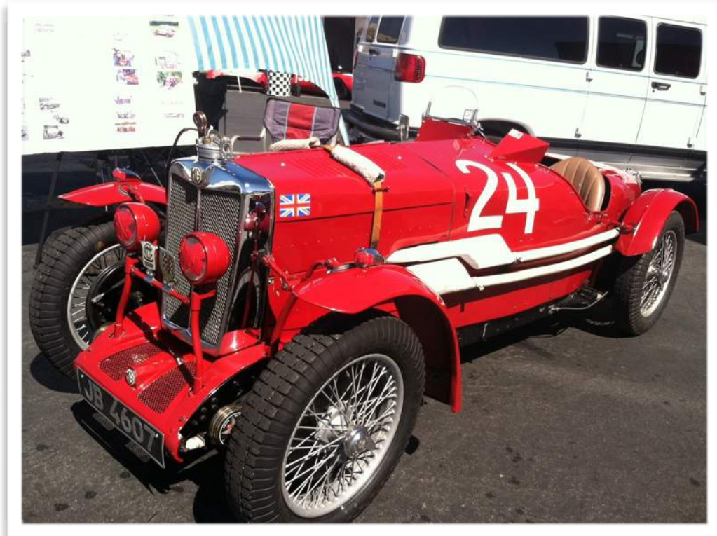
Recently spied 1934 NE at the Rolex Monterey Motorsports Reunion during Monterey Week