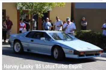
Harvey Lasky '85 Lotus Turbo Esprit