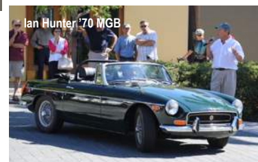
Ian Hunter '70 MGB