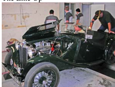
Ken on the rear bumper gets power down