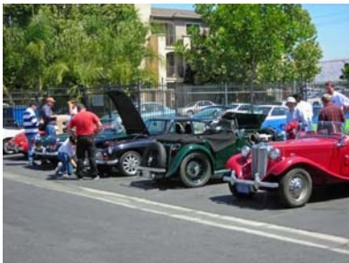
The Line Up