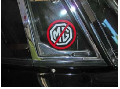
Seen on a Datsun 2000 roadster