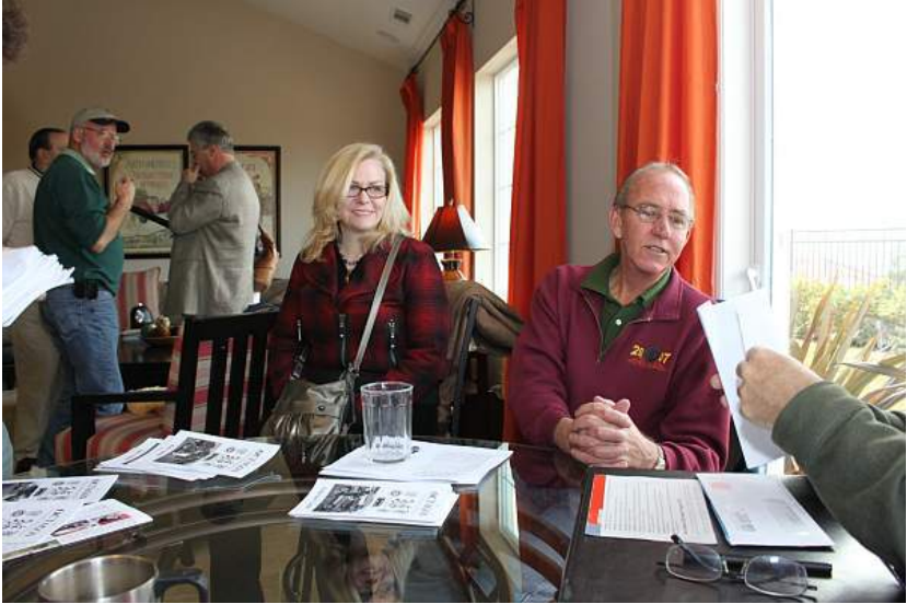
Sam takes care of a spot of business