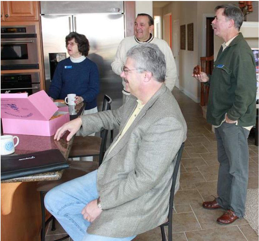
MG Owners enjoying coffee, donuts, and camaraderie