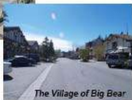
The Village of Big Bear