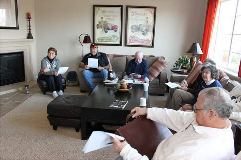
Members discuss the proposed schedule