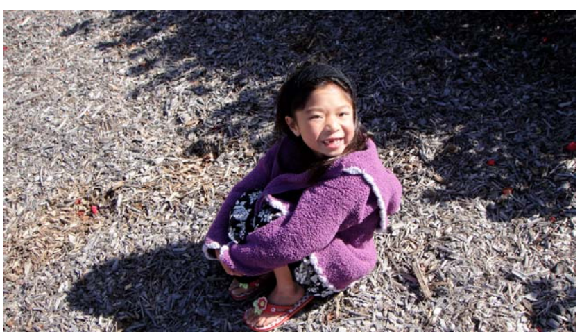
Samantha Lee

didn't start so we called aftat bed and it took the car up so we spen the whole day at the car shop until mommy one