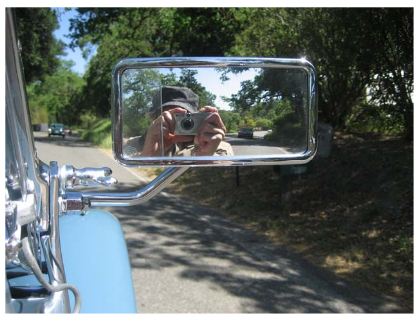
On the Cheese to Wine to Wings Run