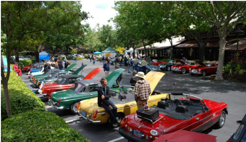
MGs by the Bay