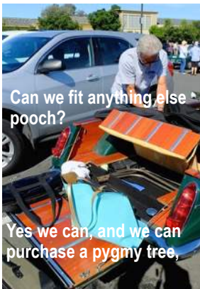
Can we fit anything else in pooch?