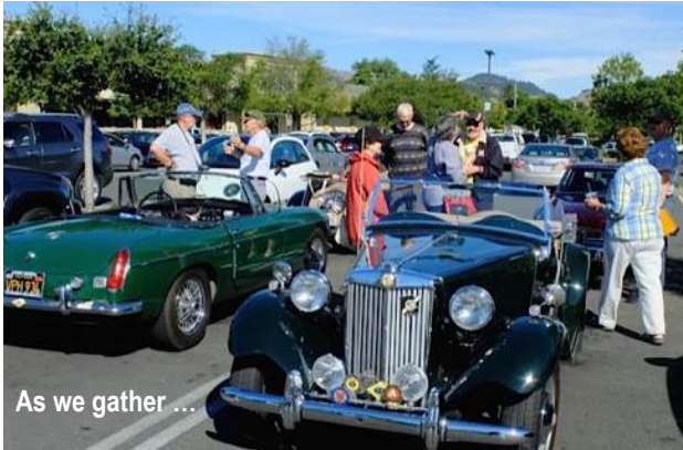
As we gather ...