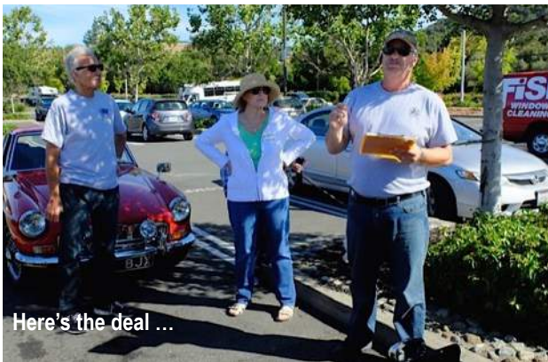
Here's the deal ...