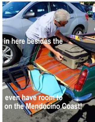
in here besides the