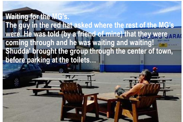
Waiting for the MG's.