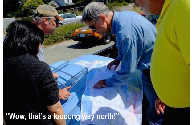
"Wow, that's a loooong way north!"