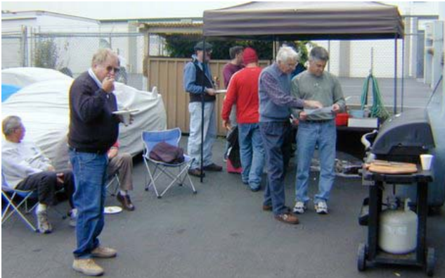
There is a Free Lunch! Thanks to On the Road Again