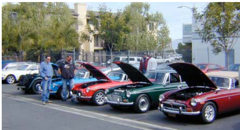
Ready to Run, Dyno Day, Bill Hiland photo

Update: Dyno Day II scheduled: Saturday, June 16