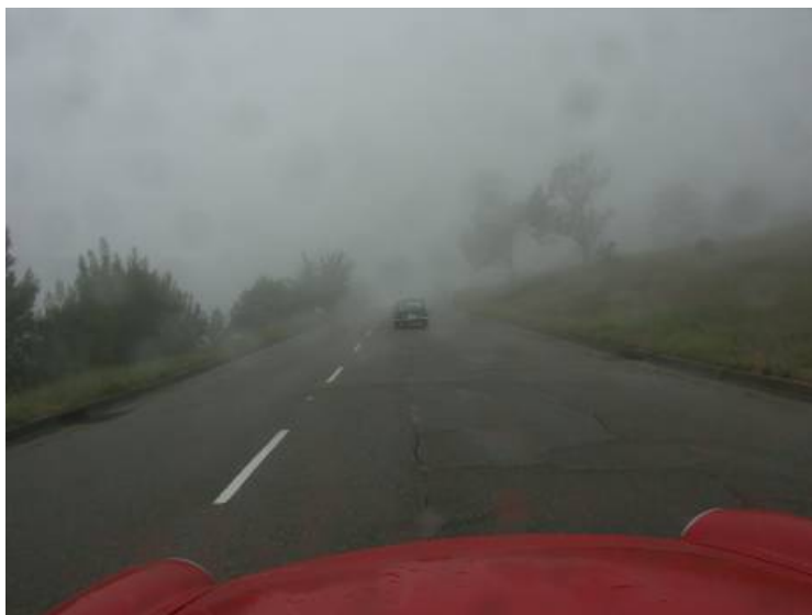
Kimber Run.