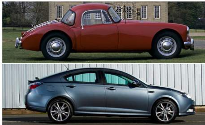
The MG A Coupe, introduced in 1956 (top) and the new MG6 fastback.

world over eagerly waiting for this other “Handover,” such as, www.whenMGbecomesallBritishagain.com . For only $.99, the App Store even has an MG Handover app, which counts down the exact number of days left until the official MG “Handover” takes place.