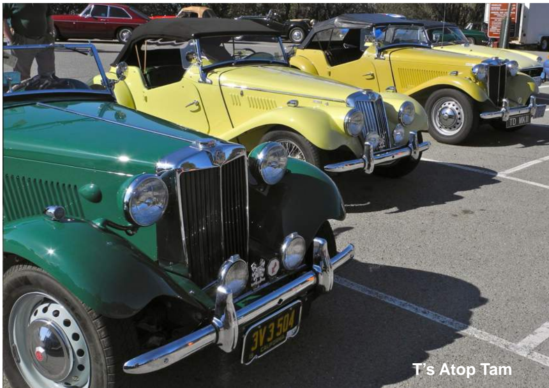
T's Atop Tam