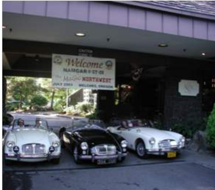
Here we are at the NAMGAR GT 28