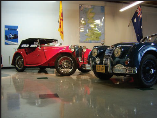
MG, Austin Healey, Jaguar, Triumph, Rolls/Bentley, Lotus

call now to talk about your dream... 408.782.1100