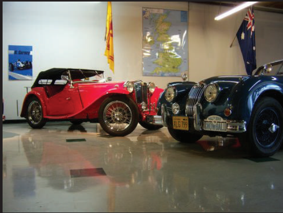
MG, Austin Healey, Jaguar, Triumph, Rolls/Bentley, Lotus

call now to talk about your dream... 408.782.1100